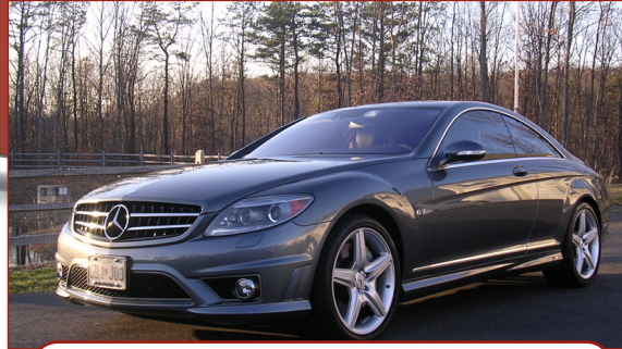
Exotics • Sports Cars • Daily Drivers