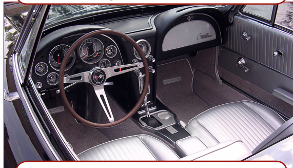
Make your car, truck or RV shine inside and out!