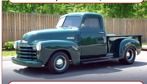
Vintage and Classic Vehicles